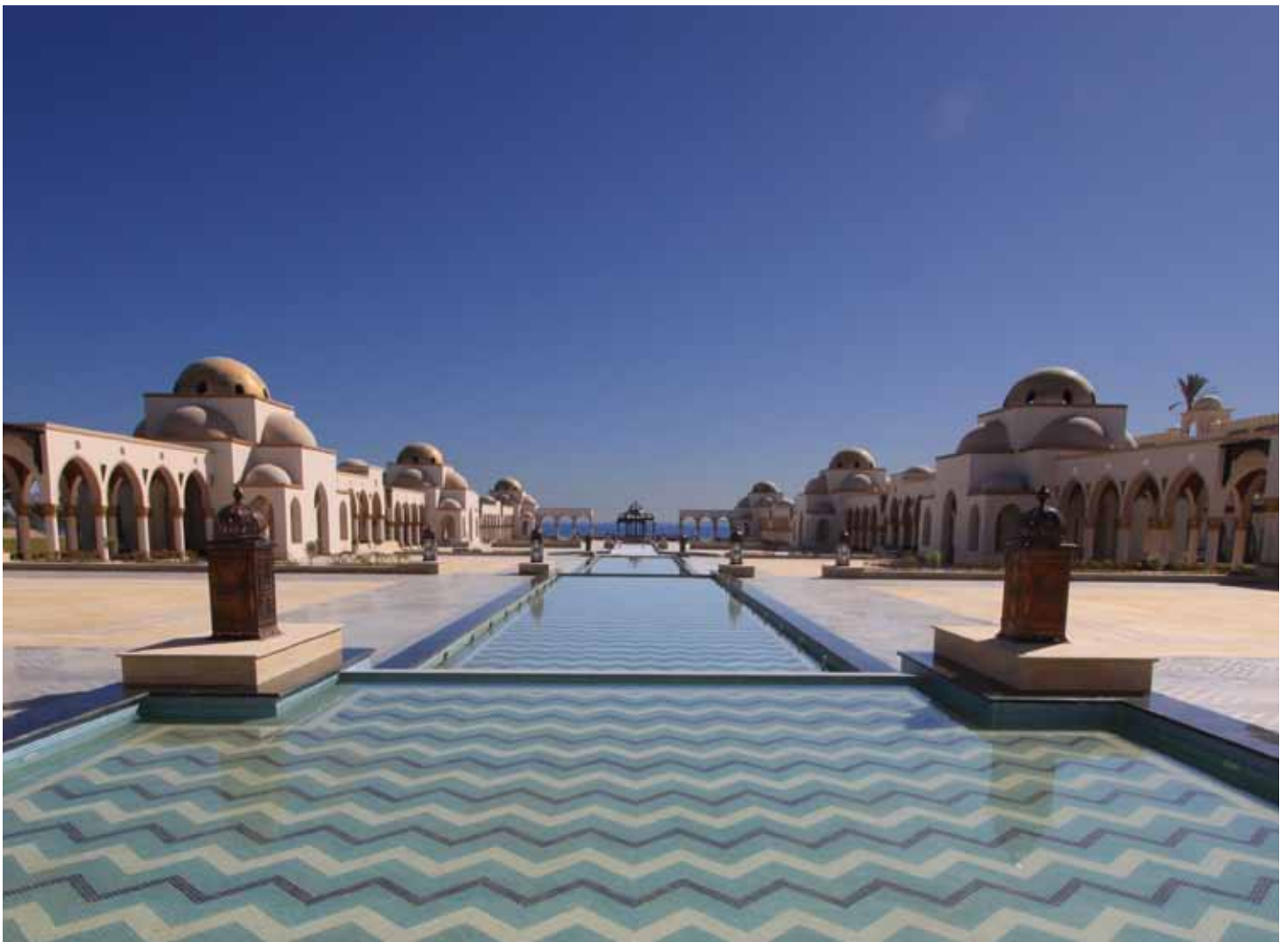
Live Photo of Central Piazza

300 Days until you can wonder around old town Sahl Hasheesh and maybe dine out at the restaurant or sip a cold beer and watch the world go by.