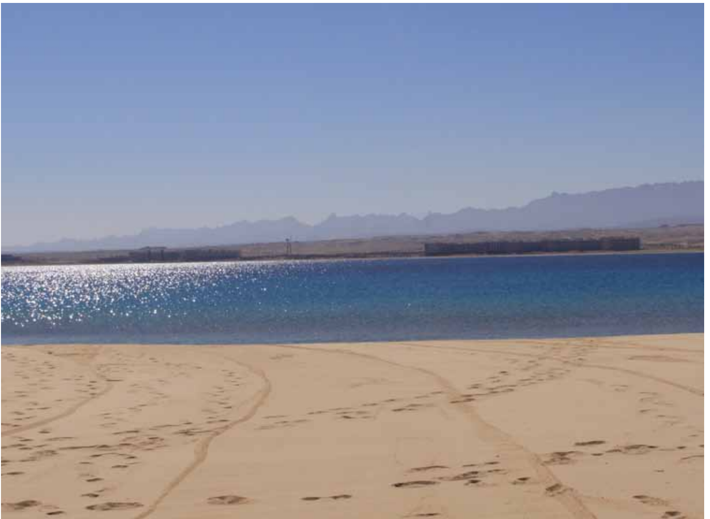
Live Photo of the beach