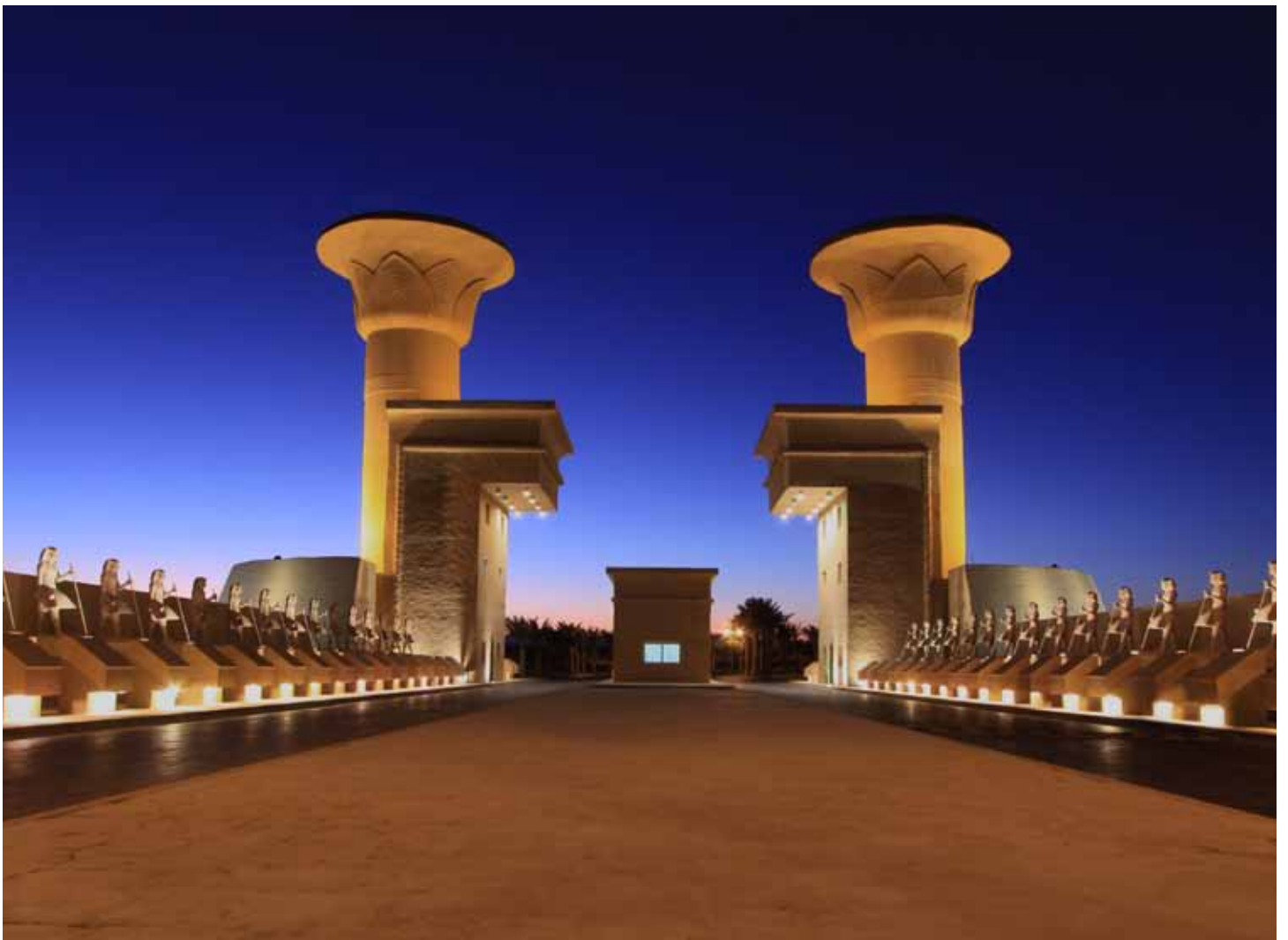
Live Photo of Sahl Hasheesh Gate