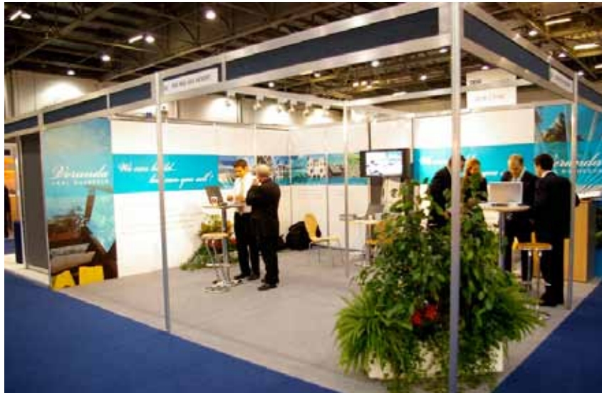
OPP - London