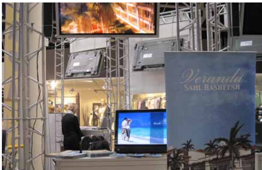
Moscow international property show