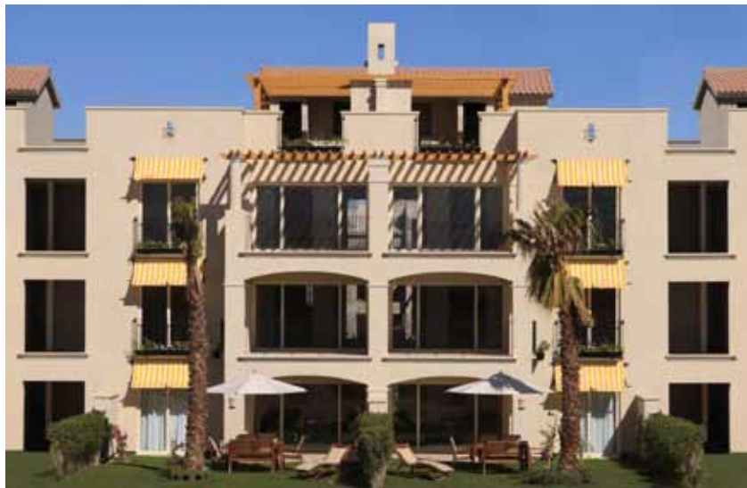
Front Elevation Live Photo

Veranda is proud to announce that the construction schedule is on time, with stages A & B to be re-leased mid 2011 along with communal facilities, including Health Spa, Swimming pools, Lagoons and the club house.