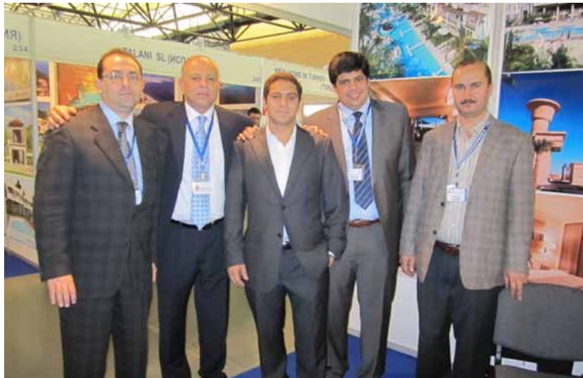
St.Petersburg International property show